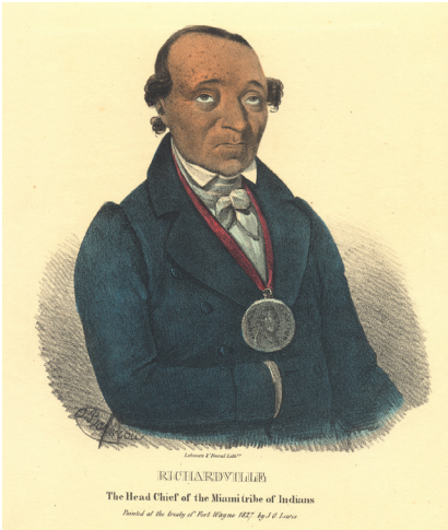
Chief Jean Baptiste Richardville (Peshewa), as seen by J. O. Lewis in 1826

Myaamia iilaataweenki . Oxford, OH: Office of Cultural Preservation, 2002 (sound recording; workbook + CD)