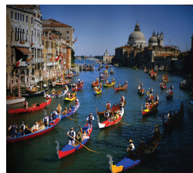
Regatta in Venice

During production, several cartographers' computers crashed and had to be upgraded because the maps were so large and so detailed. This exquisite limited edition atlas takes cartography to a new level.